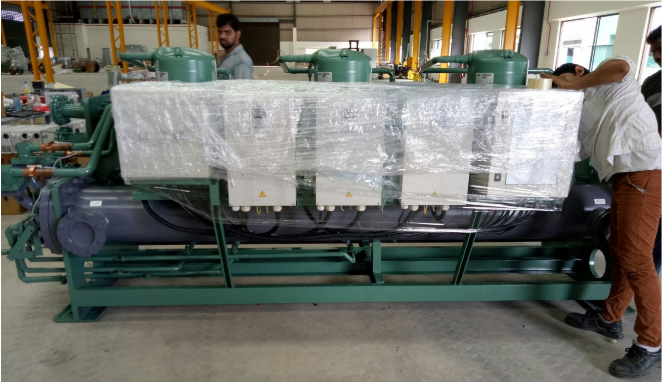
MULTIPLE SEMI-HERMETIC SCROLL COMPRESSORS EACH WITH VSD FOR CENTRALISED HOT WATER SUPPLY