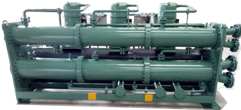
MULTI-CIRCUIT DESIGN 15 TO 450 TR