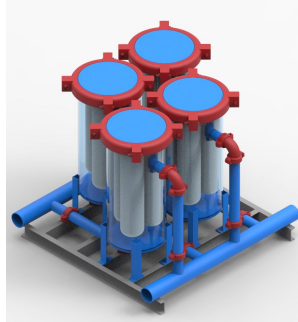
In line filters