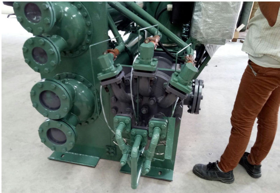
COMMON WATER CONNECTIONS FOR CHILLER AND HOT WATER