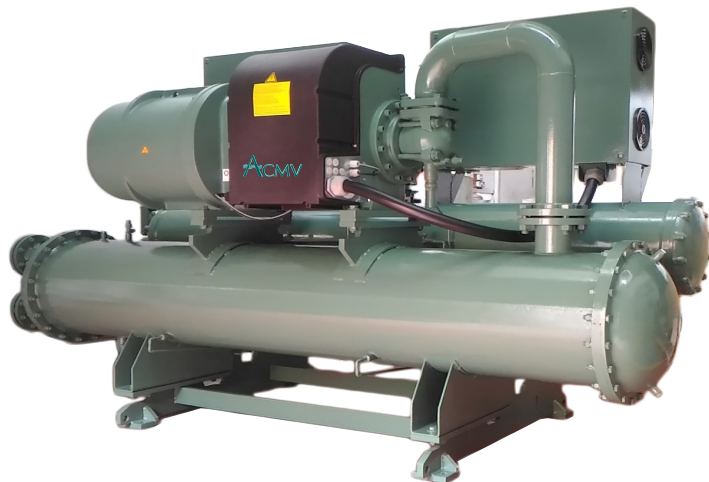
SCREW HR CHILLERS WITH BUILT- IN VSD 30 TO 450 TR