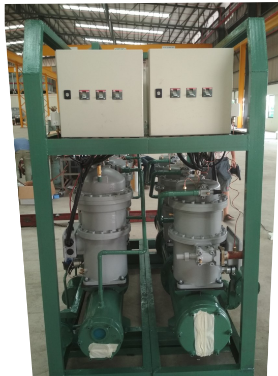
TWINS SPLIT-ABLE COMMON FRAME FOR UNITS WITH STANDBY (SEMI-HERMETIC SCROLLS)