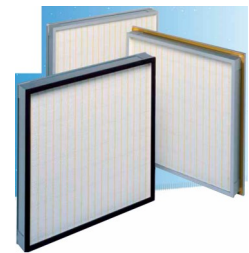
Electronic Air Filters

HVAC AHU, Clean Room and Industrial Applications Supplied w/ Heat Recovery Dehumidifier System