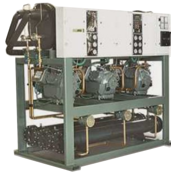
RECIPROCATING SEMI HERMETIC COMPRESSORS HR CHILLERS