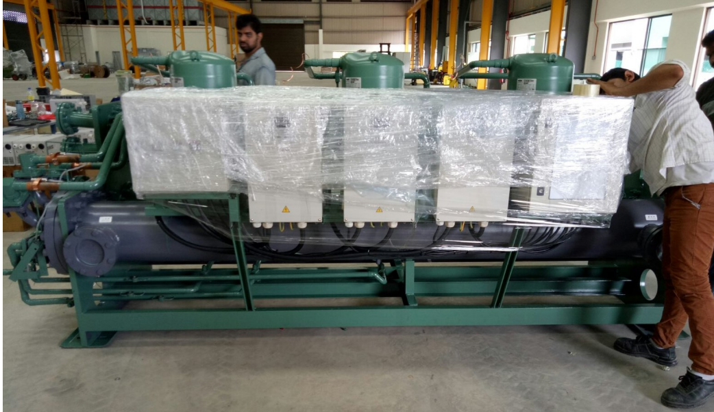
MULTI-CIRCUIT DESIGN SCROLLS, SCREW AND RECIPROCATING