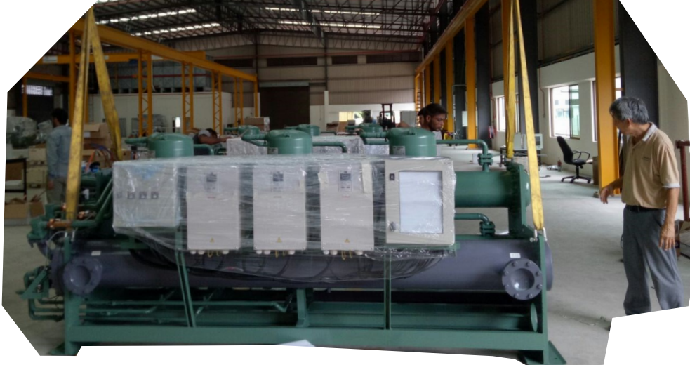
MULTIPLE SCROLL HR CHILLERS FOR DELIVERY VSD CAPACITY CONTROL COMPRESSORS