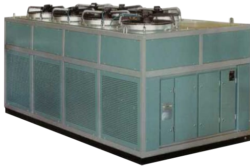
AIR COOLED HR CHILLERS