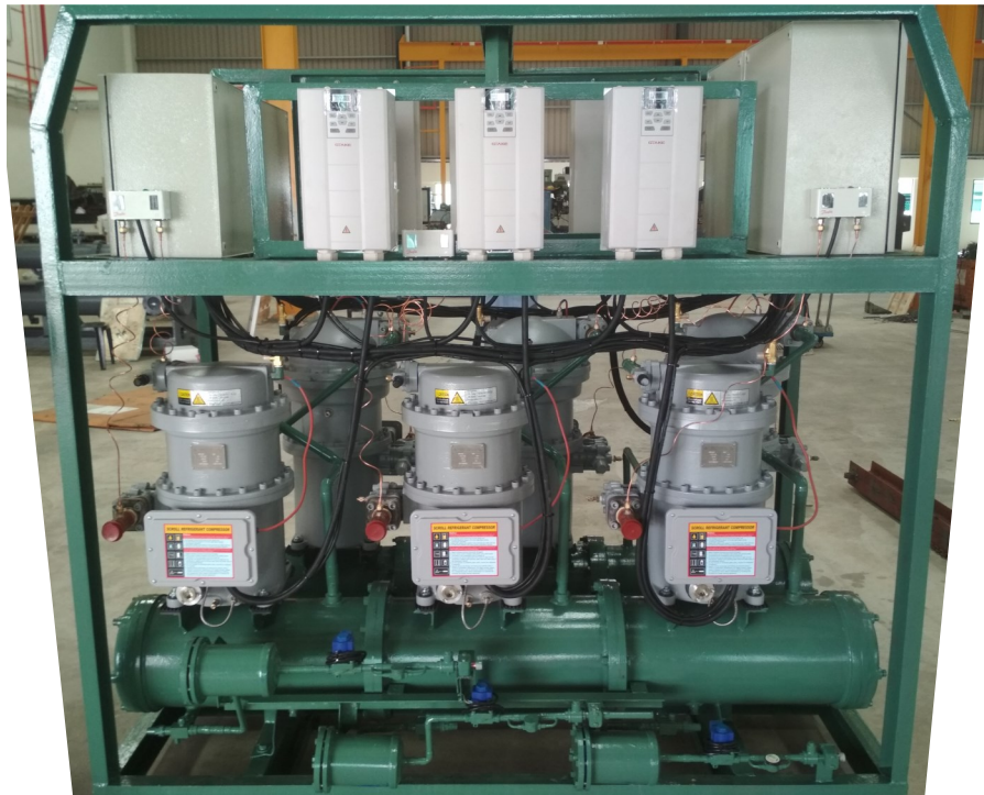
MULTIPLE SEMI-HERMETIC SCROLL COMPRESSORS WITH VSD 5 TO 350 TR